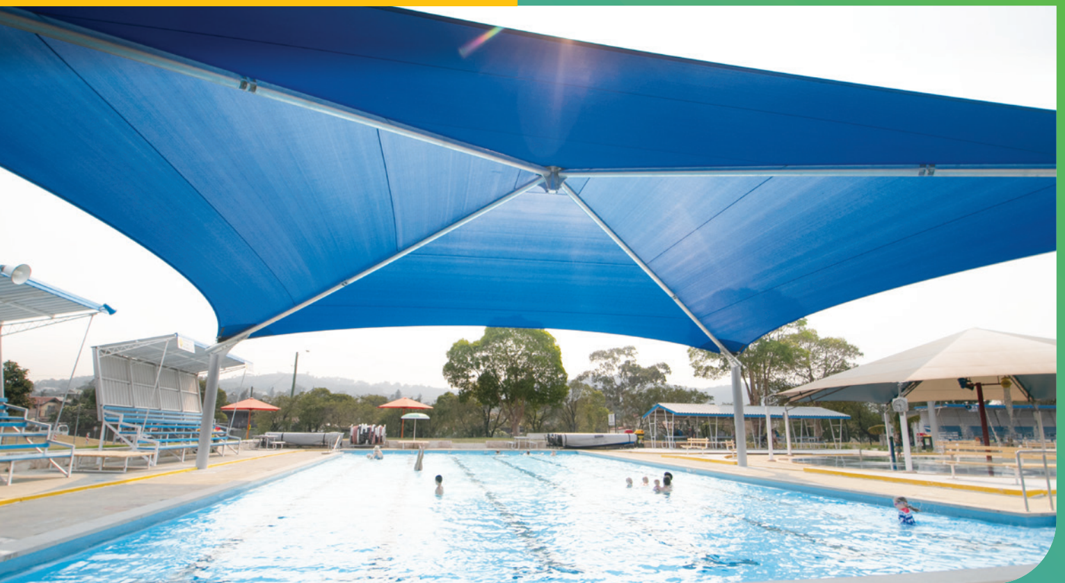
Speers Point Swim Centre, NSW

Sail Designer, Fabricator and Installer: Alfresco Shade www.alfrescoshade.com.au